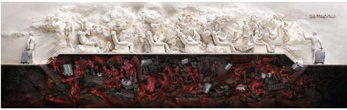
Visual 3: Heaven and Hell Press Advertisement for the Samsonite suitcase brand (URL 3)

For Samsonite, a suitcase brand, the Drago 5 agency tried to draw attention to how durable the suitcases of the relevant brand are in the 'Heaven and Hell' hybrid press advertisement. The design of the agency, which is based on the idea that your suitcase will withstand all difficulties while you travel comfortably on different journeys, is a successful press release. The project, which was prepared by using the hybrid media techniques, is also a highly rewarded design work.