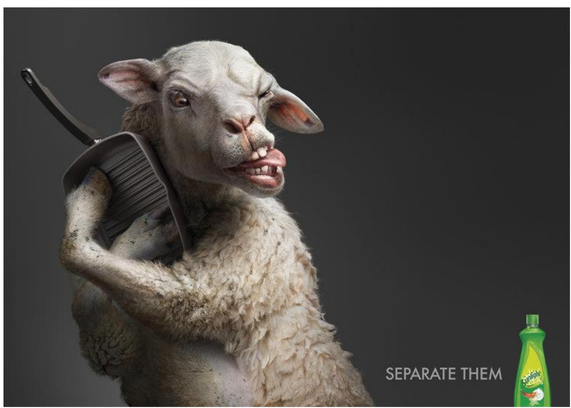
Visual 4: Press Release for Unilever Company (URL 4)

For Samsonite, a suitcase brand, the Drago 5 agency tried to draw attention to how durable the suitcases of the relevant brand are in the 'Heaven and Hell' hybrid press advertisement. The design of the agency, which is based on the idea that your suitcase will withstand all difficulties while you travel comfortably on different journeys, is a successful press release. The project, which was prepared by using the hybrid media techniques, is also a highly rewarded design work.