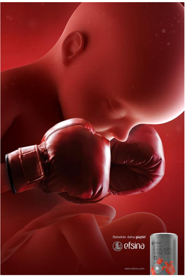
Visual 2: Efsina Pregnant Salt with Folic Acid, Graphx Agency (URL 2)

In the example of the salt press advertisement produced for pregnant women used in Visual 2, the baby design in the womb with boxing gloves is used to draw attention to the folic acid necessary for the development of babies during pregnancy. Although it seems impossible for a baby to wear boxing gloves, whose eyes have not even opened in the womb as depicted in the design, an award-winning press advertisement has been produced using hybrid media techniques to emphasize the power that folic acid salt gives to the baby.