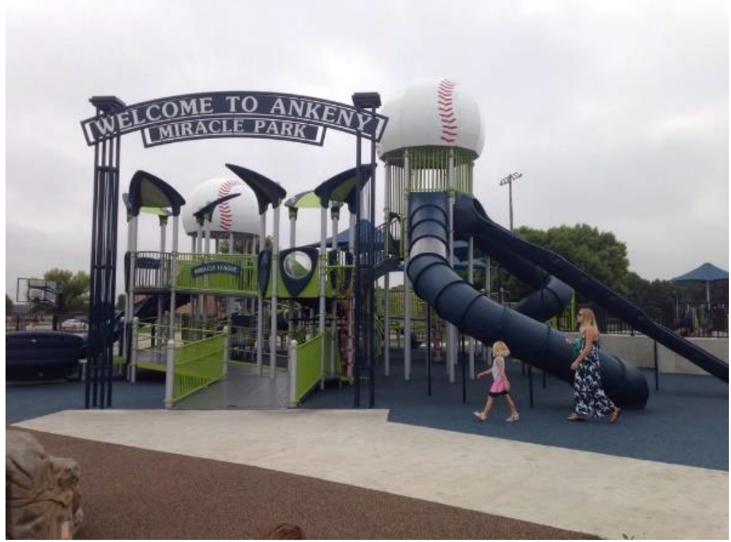
Figure 4. The Ankeny Miracle Park is available for different age groups and disabled - unrestricted children's playgrounds (Kyle, 2015)