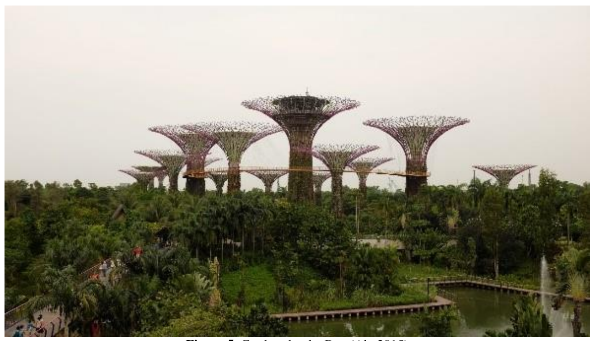
Figure 5. Gardens by the Bay (Ak, 2015)

The concept "design for all" started to become widespread in 2000's in all over the world, and today, many countries create designed environments within this scope. There are many examples of parks and recreation areas around the world, which have been created within the conception of design for all.