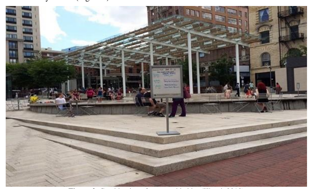
Figure 2. Combination of ramp and ladder (Khatri, 2018)

In the landscape design of an area, roads created with land-based slope, in addition to the stairs in a park design within the scope of landscape design is a practice, which can be shown as an example to the principle of flexibility in use. (Figure 2)