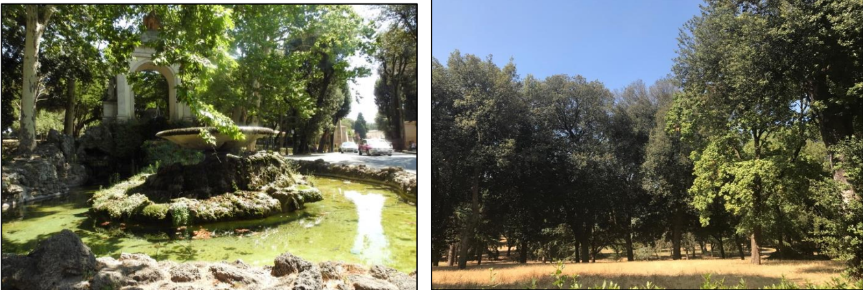
Figure 5. Use of nature and water in Villa Borghese (Orijinal, 2017)

The quality of life are badly affected by many things like faster growing population, unplanned urbanization and migration, along with changing social, economic, political statuses and impairment of the local environment that people live in. Historical parks located in Urban environment contribute to both active and passive recreation of people from all ages and therefore, these places should be considered to be around most prestigious locations in the urban environment since they provide both for the ecological equilibrium and for recreational demands of the populace and the city. Meeting the needs of the urban area with its facilities, these places are also beautifully mild green locations that are also practical. Villa borghese provides people with a variety of recreation opportunities as a historical urban park with natural flora-fauna. In this respect, it offers the opportunity to socialize and spend time with nature.