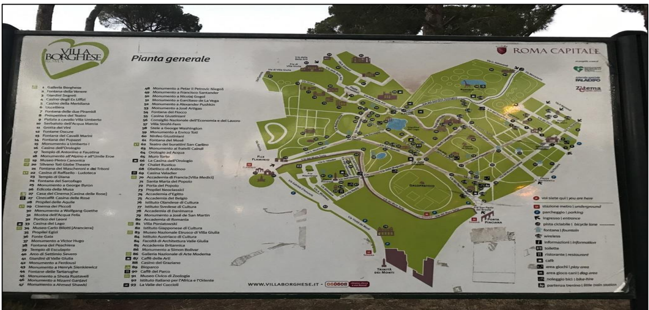
Figure 2. Layout Plan of Villa Borghese Park (Orijinal, 2017)

In 1903 the city of Rome obtained Villa Borghese from the Borghese family and opened the park to the public. The eighty hectare/148 acre-large park now featured wide shady lanes, several temples, beautiful fountains and many statues (Bianchi, 2013)