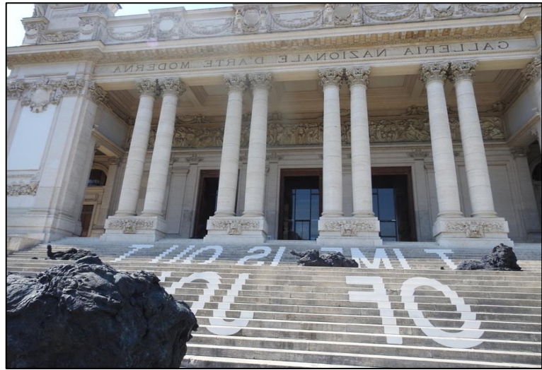
Figure 6. Art in Villa Borghese (Orijinal, 2017)