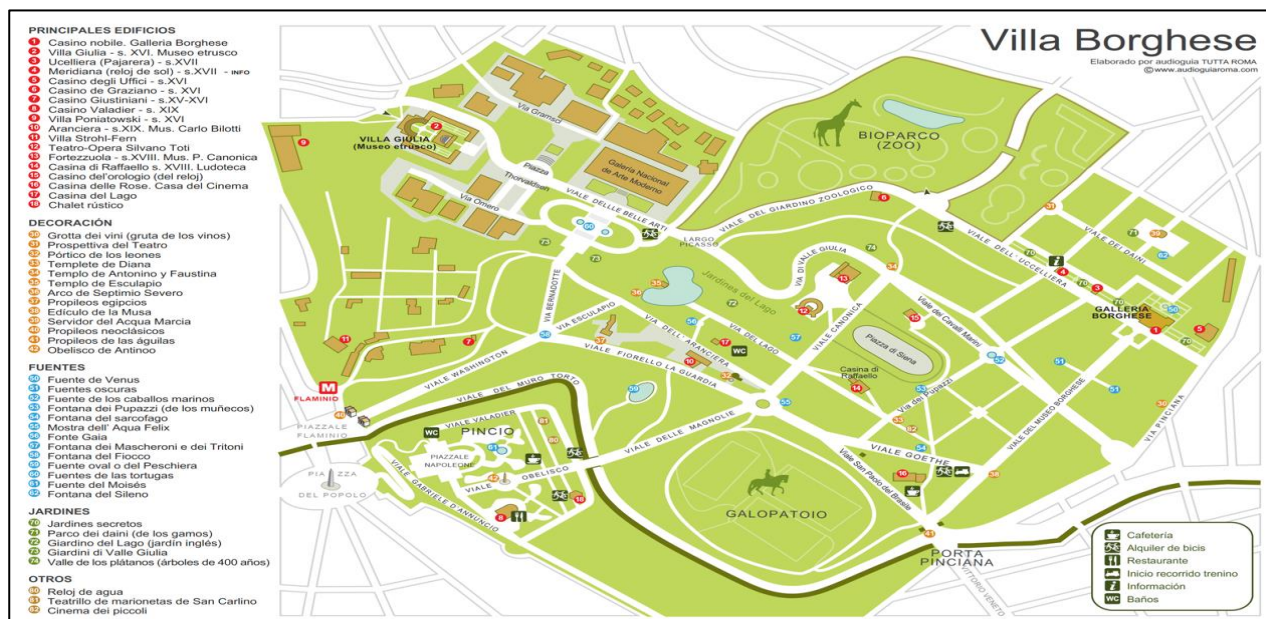
Figure 3. Layout Plan of Villa Borghese Park (URL 1, 2019)

When entered from the main gate, the road goes to a grotto fountain placed face to face with a tall garden wall instead of going to the casino. Nowadays, the Fontana dei Cavalli Marini (the fountain of sea horses) is on the location where the old garden is since it has transformed into an English landscape garden. Christoph Unterberger, a German painter and garden architect has built this fountain in 1770. The narrow road collides sideways to the front side of the casino just half a distance from a big rondel. Other parallel roads follow the two main ones and this facilitates a beautiful scenery of fountains and pavillions. While it can be seen that the casino is not the leading role in this scene, the line of roads scattered in a beautiful manner according to the layout are. The garden's elements like pavillions, fountains, aviaries and lastly, the casino, all together improve to the experience there on equal levels. Boskets are throngly found in the garden, surrounded by clipped hedges. Trees such as Pines , Cupresses , Myrtus and Laurus nobilis are also planted there. (Azzi-Visentinii, 2018).