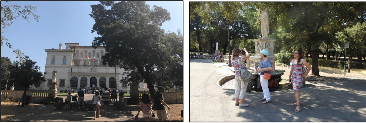
Figure 4. Villa Borghese (Orijinal, 2017)