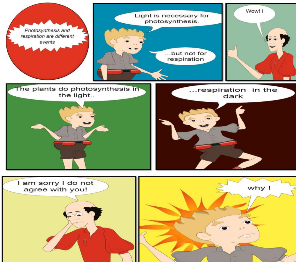
Table 1. Panels related to the misconceptions of photosynthesis and respiration

Satisfaction strategy: In the ARCS motivational model, satisfying learners are required to have positive thoughts about their learning experiences. In this context, the examples have been chosen from the learner's life in LSCCB. Thus, the learner aims to gain a new point of view by solving a problem that he has not solved in life before.